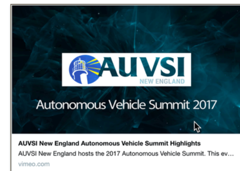
Event Promotional Video